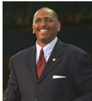
GOPAC Chairman, Michael Steele

GOPAC Chairman, and recent Shepperd Distinguished Lecture guest, Michael Steele, made quite a stir at this year's Republican National Convention as he urged Americans to, "...drill, baby, drill...and drill now..." as a means to end dependence on foreign oil and gas. The statement was quickly embraced by the attendees and chanted throughout the convention.